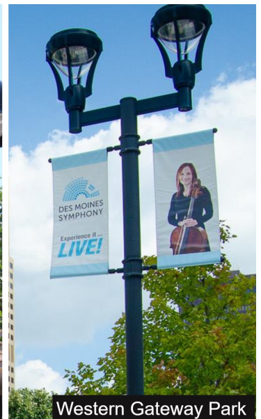
Western Gateway Park