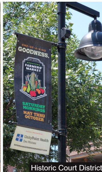
Historic Court District